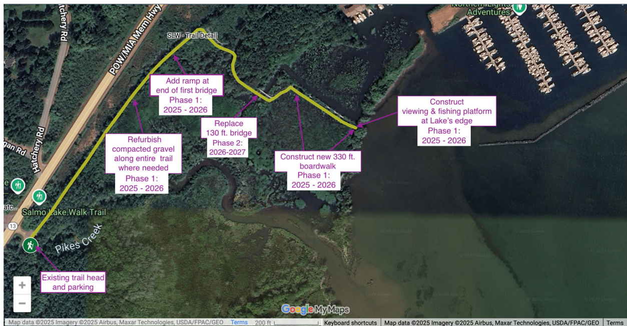
Diagram of Salmo Accessibility Project Note the labels for 330 ft. boardwalk plus viewing & fishing platform