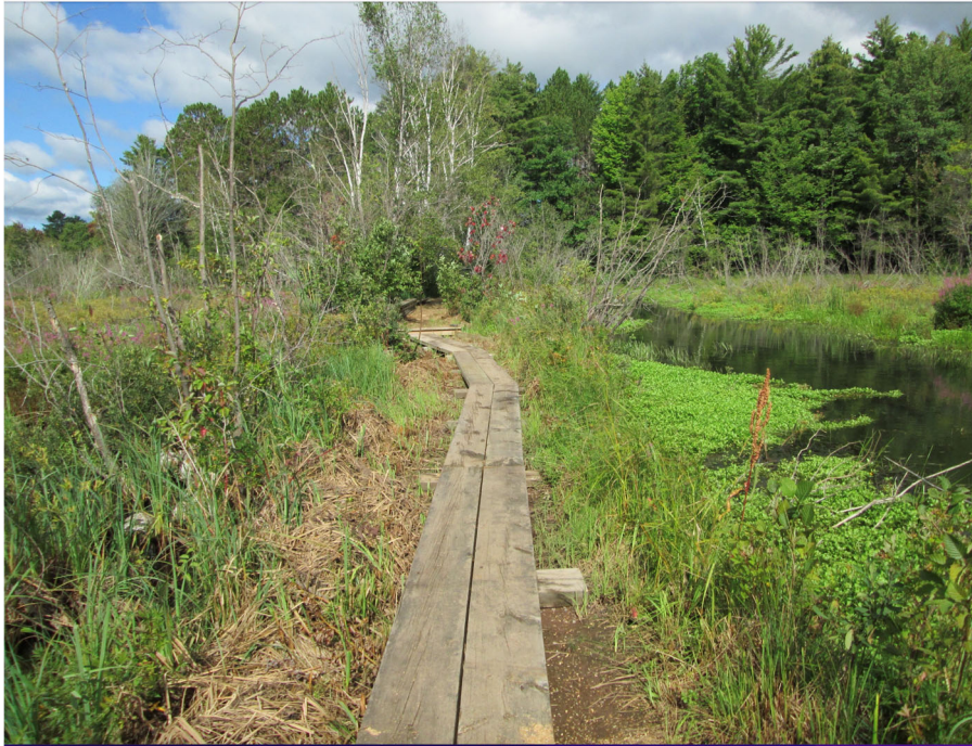
Example location of where the elevated boardwalk will be installed